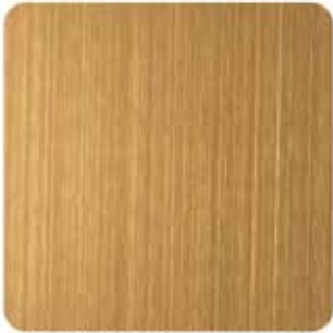
ANTIQUÉ HL-OBR+FG3 Antique Hairline Orange Bronze+FG3