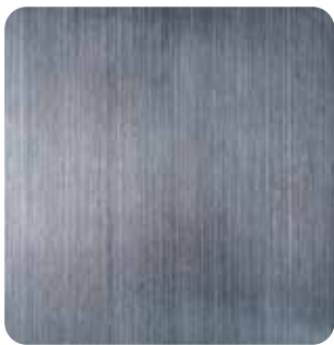
HL-BK Hairline Black