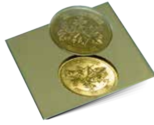
MR-GDZT Mirror Platinum Gold