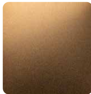
SB-OBR Shot Orange Bronze