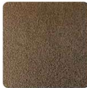
7J-OBR Emboss(7J) Orange Bronze