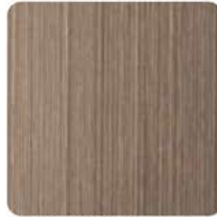
ANTIQUÉ HL-BR+FG3 Antique Hairline Bronze + FG3