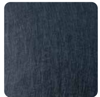
VBF1-BK Vibration F1 Black+FG3