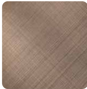
CH-CPG Cross Hairline champagne Gold