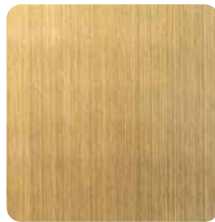
HL-GDZT Hairline Platinum Gold