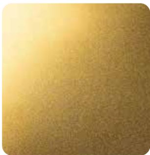
SB-GDT Shot Titanium Gold