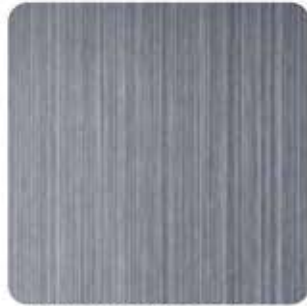
ANTIQUÉ HL-BK+FG3 Antique Hairline Black +FG3