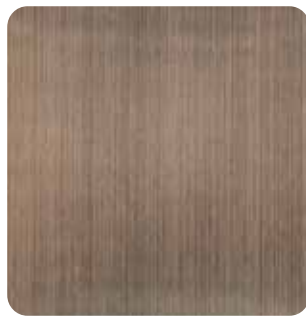
HL-BR Hairline Bronze