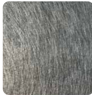
HV-CPG Hard Vibration Champagne Gold