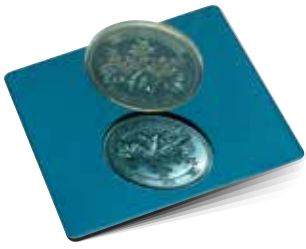
MR-B2 Mirror Blue