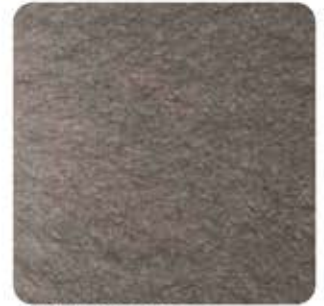
ANTIQUÉ HL-BR Antique Vibration Bronze