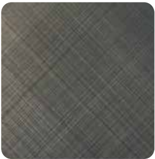
CH-BR Cross Hairline Bronze