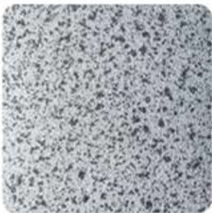
7J-MS301 Emboss(7J)+Etching (Ms-301)