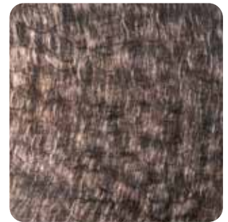
PV-PBR Pearl Vibration Pink Bronze