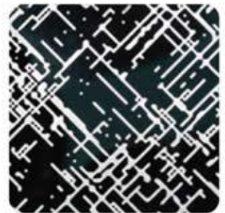
MR-HMS325 Mirror Finished Black (MR-1) +Etching (ms-325)