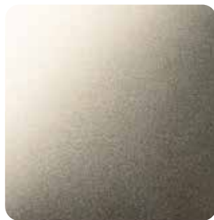
SB-NIS Shot Nickel Silver