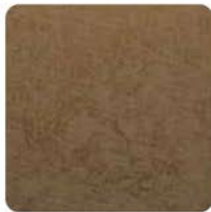
CAST SKIN-OBR Casting skin F orange Bronze +FG3