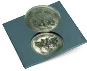
MR-BK Mirror Black