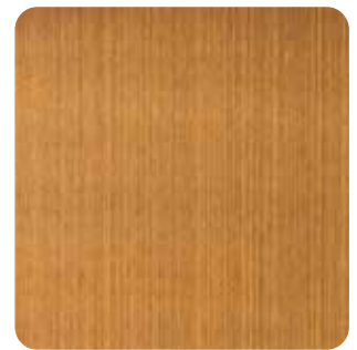
HL-OBR Hairline Orange Bronze+FG3