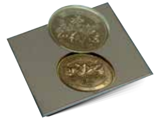
MR-PBR Mirror Pink Bronze